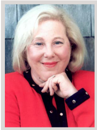
Professor Rosabeth Moss Kanter Ernest L. Arbuckle Professor of Business Administration Harvard Business School Chair and Director, Advanced Leadership Initiative

Professor Kanter was recently featured in the Boston Globe article, “Harvard Professor Warns of Infrastructure Woes.” In the article, Kanter discusses her latest book, Move: Putting America’s Infrastructure Back in the Lead , the history of America’s railroad, highway, and airline systems and their decline over the past half century, and provides examples and suggestions for improving the current state of infrastructure and transportation systems in the U.S.