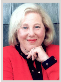
Professor Rosabeth Moss Kanter Ernest L. Arbuckle Professor of Business Administration Harvard Business School Chair and Director, Advanced Leadership Initiative

Professor Kanter's new book, Move: Putting America's Infrastructure Back in the Lead has received extensive global media attention. Professor Kanter and her ideas for revitalizing America's transportation system are featured in such publications as the New York Times , the Wall Street Journal and the Boston Globe , as well as various interviews with NPR, the Weather Channel, C-SPAN and the Daily Show with Jon Stewart. For a detailed listing of all of Professor Kanter's latest media engagements, please visit the Advanced Leadership news page here: http://advancedleadership.harvard.edu/news